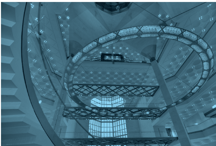
The Museum's impressive sweeping staircase.

With an original total budget of approx. QR873 Million (US $ 239 Million) of which the security solution alone was for US $5.25 Million, the contract for this prestigious project was the object of fierce competition in the industry.